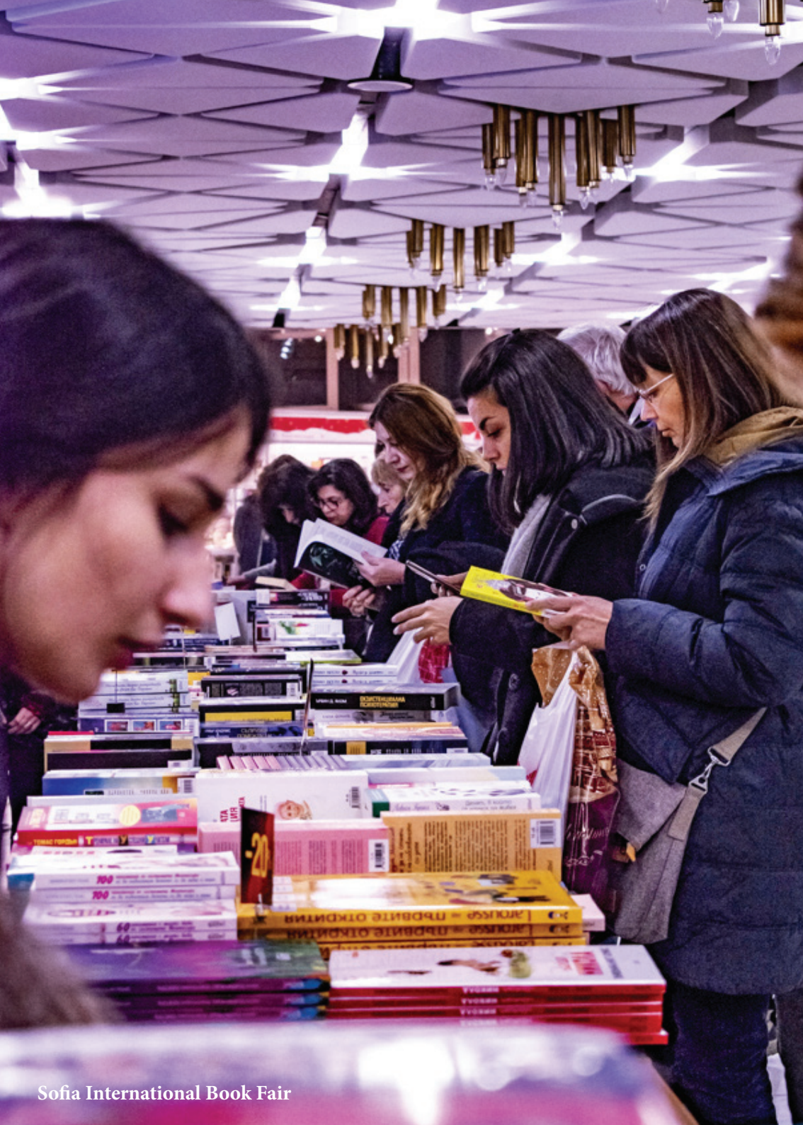
Sofia International Book Fair