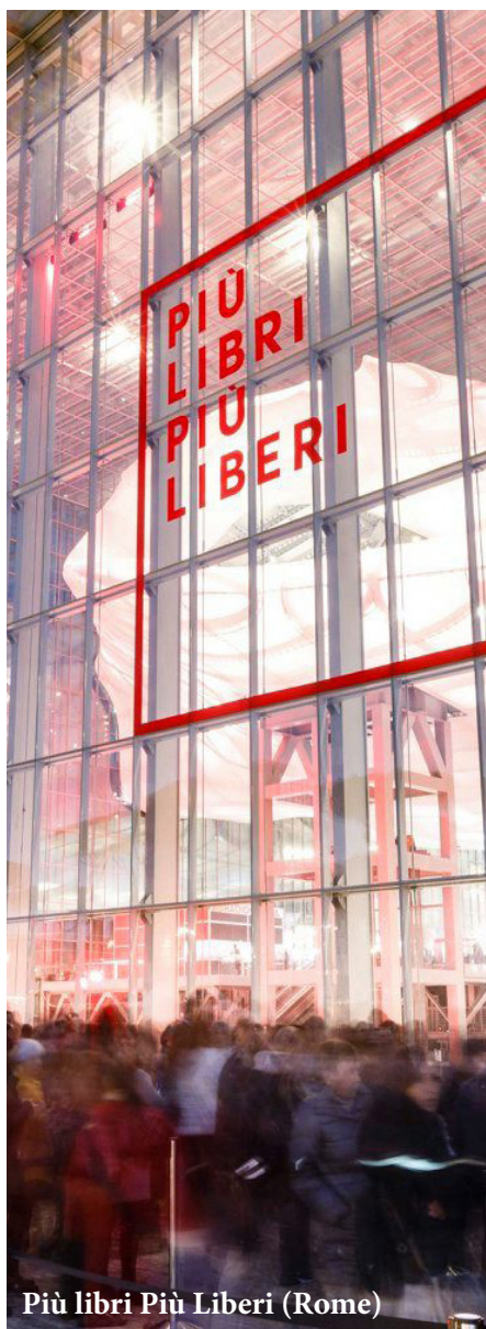
Più libri Più Liberi (Rome)

newitalianbooks.it is promoted by the Istituto della Enciclopedia Italiana Treccani, with the support of the Italian Ministry of Foreign Affairs and International Cooperation and the Italian Centre for Books and Reading (Ministry of Cultural Heritage and Activities and Tourism), in collaboration also with the Italian Publishers Association.